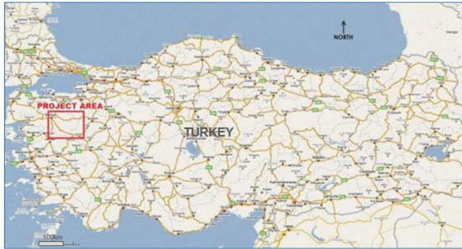
Figure from OreWin, 2019

The Gediktepe Project is located in the Balıkesir province of Western Turkey (Figure 1-1). The UTM Zone 35N, European Datum coordinates of the approximate center of the Project are 636,000E, 4,358,000N.