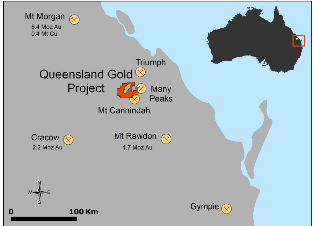
Figure 1: Location Map of Queensland Gold Project

EMX's land position is strategically located in the Tasman Orogenic belt in northeastern Australia. Evolution Mining has reported gold production from their Cracow (2.2 million oz) and Mt Rawdon (1.7 million oz) projects located ~100 km from the Queensland Gold Project 4 . Historic production from Mt Morgan totals 8.4 million ounces of gold and 0.4 million tonnes of copper 5 .