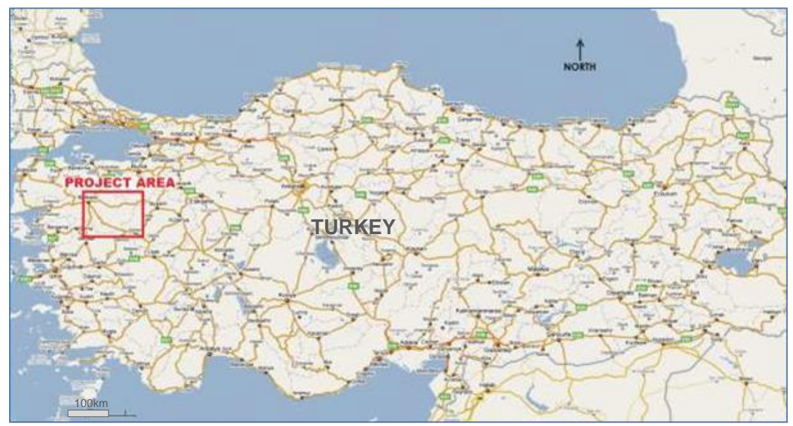
Figure from OreWin, 2019

The Gediktepe Project is located in the Balıkesir province of Western Turkey (Figure 1-1). The UTM Zone 35N, European Datum coordinates of the approximate center of the Project are 636,000E, 4,358,000N.