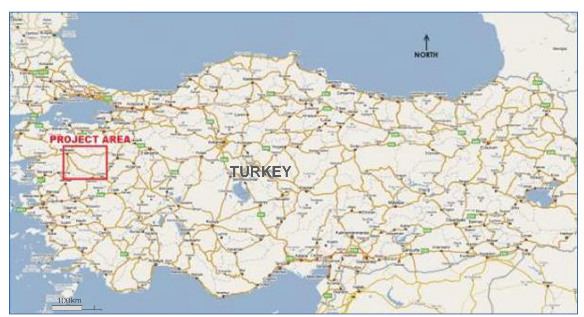
Figure from OreWin, 2019

The Gediktepe Project is located in the Balıkesir province of Western Turkey (Figure 1-1). The UTM Zone 35N, European Datum coordinates of the approximate center of the Project are 636,000E, 4,358,000N.