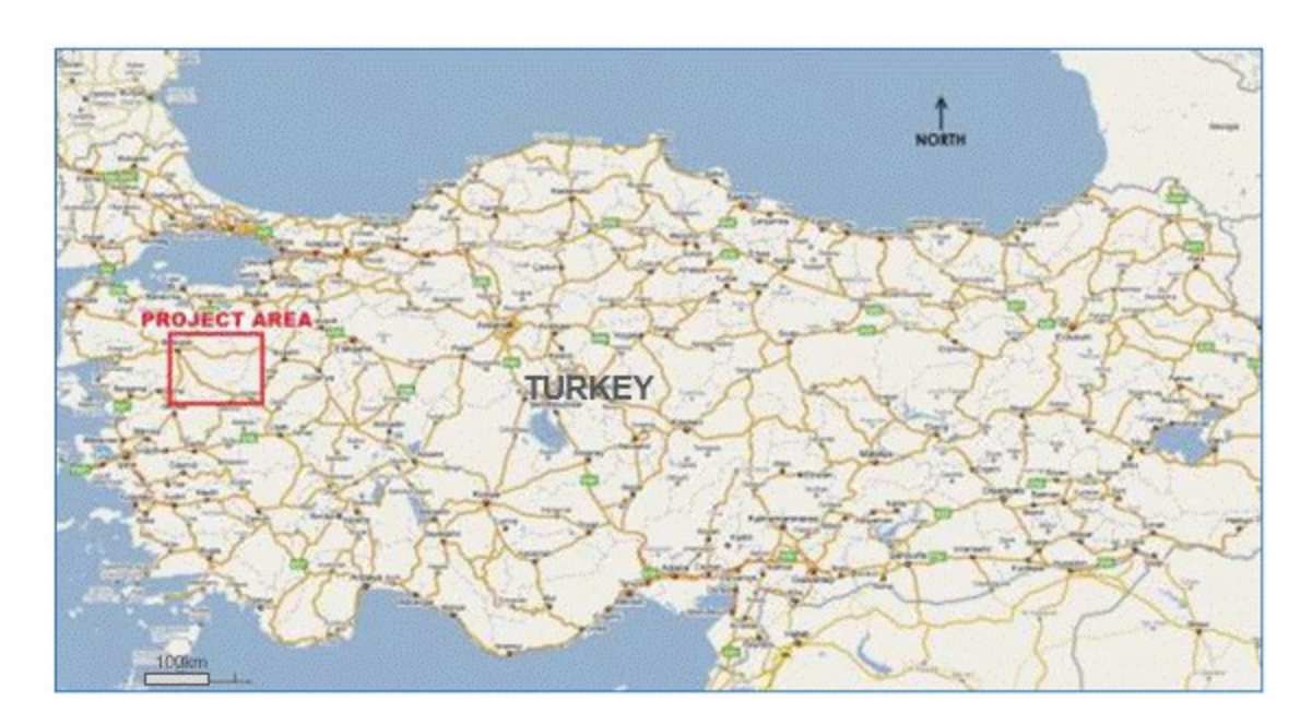
Figure from OreWin, 2019